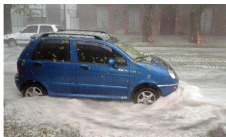
The hailstorm outside Gethsemani Church