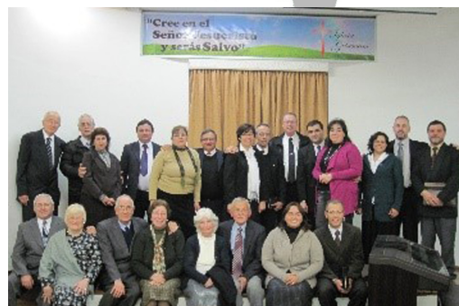
Some of the EMU pastors & missionaries, as well as a few folks who have had a part in Gethsemani's establishment & growth in the past.