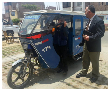
The very different transportation in Peru. Uruguay has none of these motocabs.