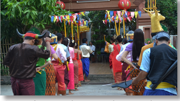
A group of young people getting ready to enter a house to perform the Trot Dance for the New Year

Email: office@emuinternational.org Website: www.emuinternational.org Phone: (864) 268-9267