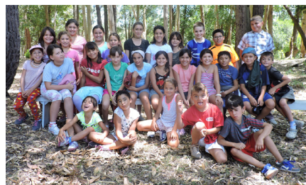
Children, adolescents, and Jovenes Sponsorship recipients in January 2016