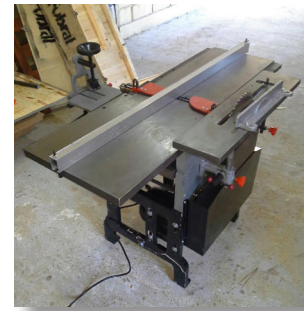
The new table saw for making the bunkbeds at Camp Emmanuel