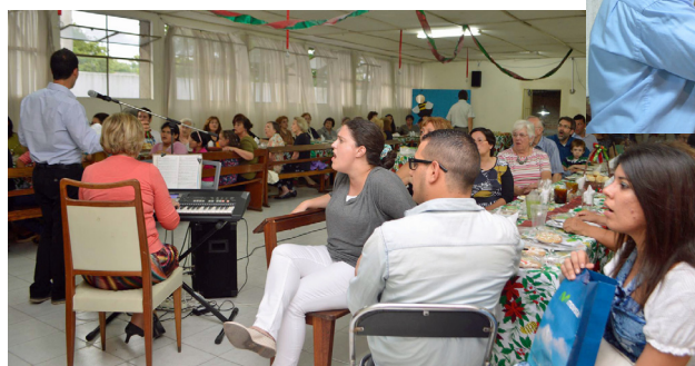
All of our churches in Uruguay have Christmas banquets, like this one at Calvary Temple of Montevideo. Rather than turkey or ham, the main dish was succulent grilled beef. Nice custom!

Looking ahead to the coming months, it is difficult for me to predict what will happen. Often, even the things I think are a "sure thing" evaporate in a flash of the unexpected. Without a knowledge that God loves us and is in control, these turn of events would be far more discouraging. Also, a lifetime of seeing Him bring greater blessing out of