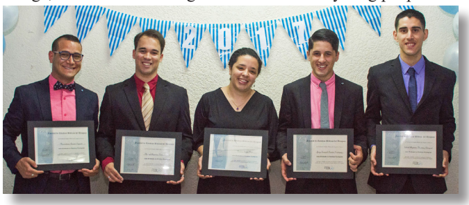
First graduates from FEBU

A milestone was marked on December 3 as FEBU (Facultad de Estudios Biblicos del Uruguay), the country's first 4-year Bible college, celebrated its first graduation with five young people