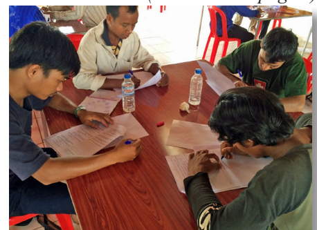
Students taking an exam at the Pastors' School