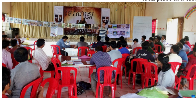
One of the missionaries teaching at the Pastors' School (Yes, that is a lady at bottom right. Church leaders of both sexes are taking the classes.)