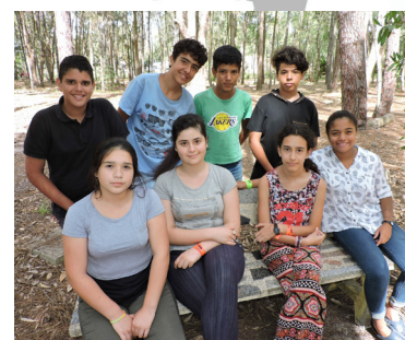
Above & Right: Jovenes attending camp via the Sponsorship Fund