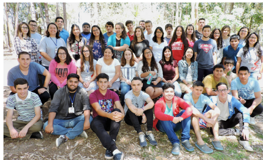
Left: Jovenes Camp