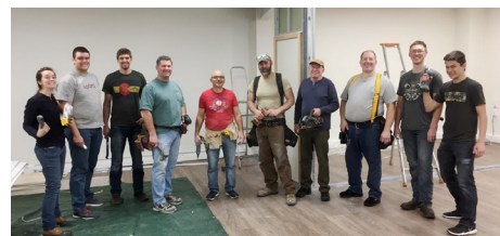
The USA team who worked on the Sarcelles church renovation

In the February newsletter, there were some pictures of the construction work on the new church facility in Sarcelles, France . An enormous amount of work was completed by the USA and French teams in January. The church has a rent-to-buy agreement with the owner of this 5,000 square foot building. The first three years of rent have already been paid.