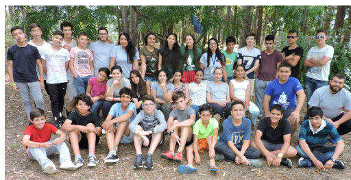
Adolescent Camp at Camp Emmanuel