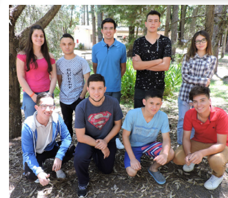
Adolescents who were able to attend camp through the Sponsorship Fund