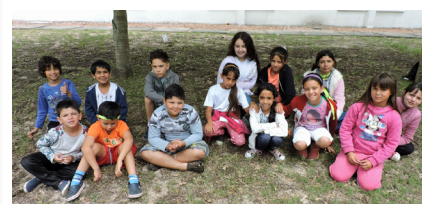
Children who were able to attend camp through the Sponsorship Fund