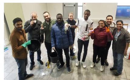
The Sarcelles church members who worked on the church renovation and clean-up (continued on page 4)