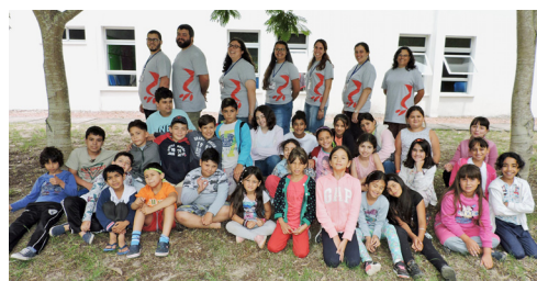
Children's Camp at Camp Emmanuel Counselors in back row