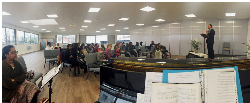
The first service in the new auditorium of the Sarcelles Baptist Church