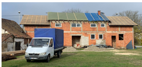
Roof repair on the backside of the new building. The roof will be traditional clay tiles.