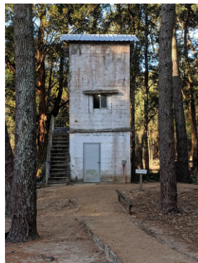
The old 3rd floor water tank was converted into extra storage. A large hole was cut in the ceiling of the 2nd floor with stairs added. Rick & Marcos added the tin roof.