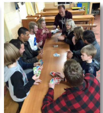
One of the nightly, multi-deck UNO marathons at camp