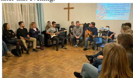
Time of singing & fellowship after the Friday evening youth service