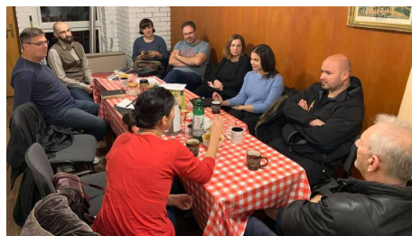
The adult members of the Baptist Church of Virovitica