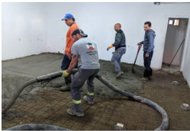
Pouring the floor for one of the women's cabins