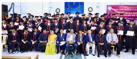
The 21st graduation class at the Millennium Methodist Church of Secunderabad