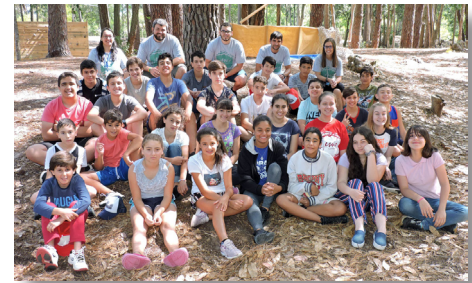
Above: Adolescent camp 2020.