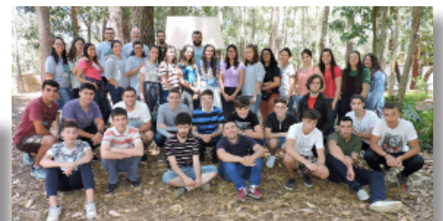
Above: Jovenes Camp - January 2020 Below: Jovenes sponsored at camp.