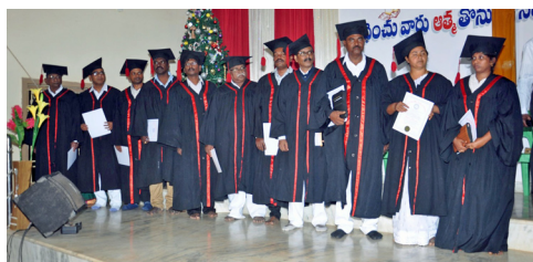
The 16th graduation class at the Sharon Baptist Church of Kavali