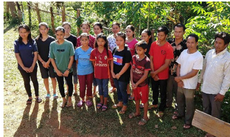
Saom Kining church baptismal candidates and two of the Jarai elders