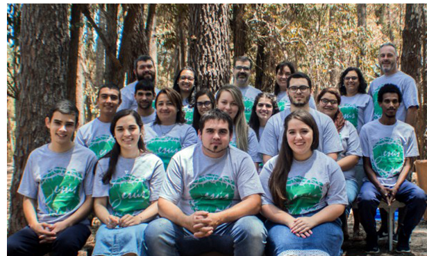
Staff training at Camp Emmanuel - January 2020