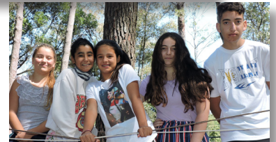
Right: Adolescents sponsored.