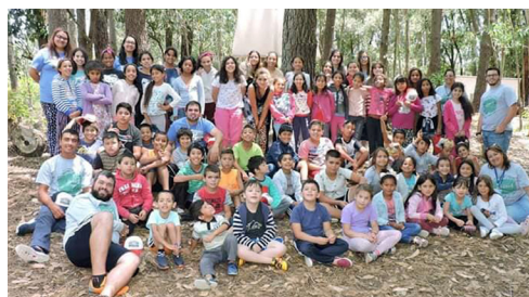
Above: Children's camp - January 2020. Below: Children sponsored at camp.