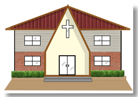
Proposed church/Bible school building in Ban Lung, Cambodia

(Note: Almost $9,000 of the needed amount has been given since this need was first shared.)