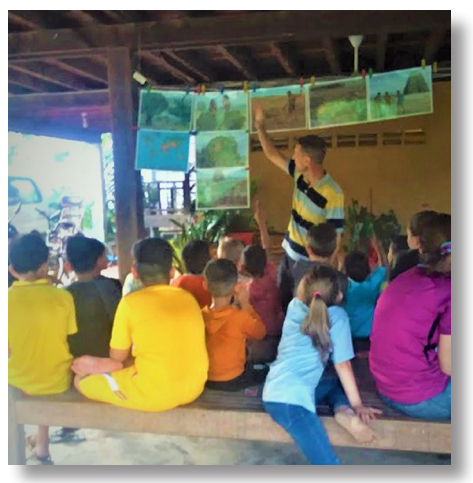
Neighborhood Bible class in Stung Treng