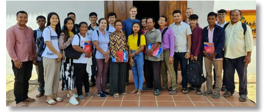
Old Testament overview class in Stung Treng, Cambodia