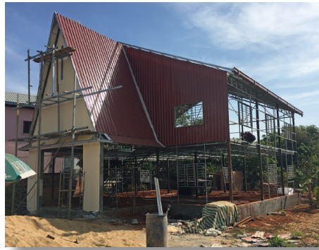
Progress on the new Lubanseak Church building that will host the Pastors' School

Lubanseak Church in Ban Lung, for which EMU donors contributed $30k towards expenses, is well underway in building their new auditorium. (This church building will be used as a regular church sanctuary and for the