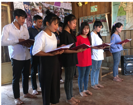
Young people at a Tampuan church using the new hymnal for their language

Lubanseak Church in Ban Lung, for which EMU donors contributed $30k towards expenses, is well underway in building their new auditorium. (This church building will be used as a regular church sanctuary and for the