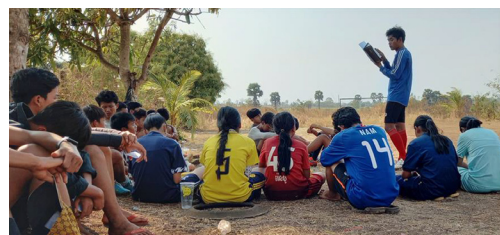
The Bible lesson after soccer practice

restrictions. We taught through the stories of Genesis 1-3, laying the foundation for understanding the true nature of God, man, and sin. This past week we started meeting again to practice, but in smaller groups. Please pray for these teens to receive our teaching as it really is, the Word of God.