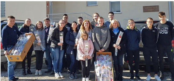
The church group from Koprivnica that ministered to the women in the city of Petrinja