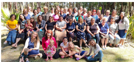
Above: Ladies' Retreat at Camp Emmanuel

It was good to see that Camp Emmanuel in Uruguay has been able to have some one-day camps and retreats during their Uruguayan spring. The kitchen/cafeteria project was finished in time for the Ladies' Retreat and the Couples' Retreat. In November, the training of the summer staff began in anticipation of holding children's, youth, and family camps in January and February 2022. Pray that the country's COVID regulations will loosen up even more so that more folks can attend the summer camps.