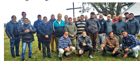
Men's winter retreat at Camp Bethel

Beginnings." Pray that this will truly be a time of spiritual renewal and, for some, a new beginning in Christ.