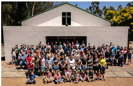
Family Camp - February 2023