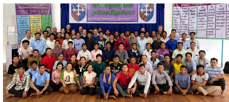
April 2023 Pastors' School in Ban Lung

At the beginning of April, we had another successful session of our Ratanakiri Pastors' school, studying through chapters 9-11 of Romans. Temperatures spiked to the high 90's during our four-day session, and inside the church it was undoubtedly over 100 at times. However, in spite of the temperatures