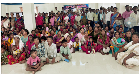
Bethel Training Center Conference

After participating in the annual ACBC (Association of Certified Biblical Counselors) Conference in Fort Worth, TX, October 7-9, we left their airport on the 10th and flew to Kathmandu, Nepal, arriving there on the 12th. We then took a short flight to Biratnagar in southeastern Nepal. On the 13th, while there, and in conjunction with the Bethel Training Center, I taught God's Design for Marriage: Perfect Plan and Redemption . We had a few ice breakers along with playing the "newlywed" game. Just suffice it to say, not everything translates easily!