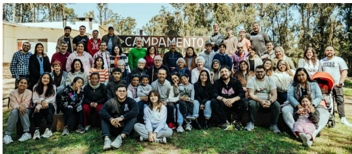
(Above) Gethsemani Church family retreat (Below) A couples retreat at Camp Emmanuel

On Saturday and Sunday, September 28-29, most of our church enjoyed a two-day retreat at Camp Emmanuel. Every time we spend time in God's word and with godly people, we are blessed. May all of us always have opportunities like this! †