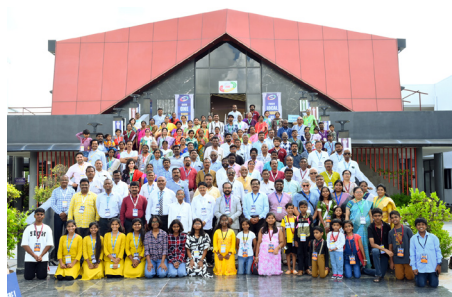
Good News 360 Conference in India

In November another Ratanakiri Pastors' School module was held in Ban Lung. The theme of this series of teaching was World Missions. Some believers from the capital, Phnom Pehn, taught this curriculum along with the help of EMU missionaries. I hope to have a report on that conference soon.