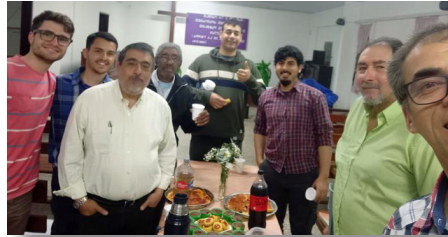
Men's & Women's groups at Emmanuel