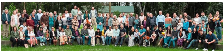
Calvary Temple of Montevideo church retreat at Camp Emmanuel in October