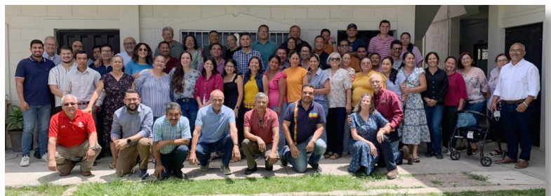
Iglesia Bautista Imanuel Conference in Honduras