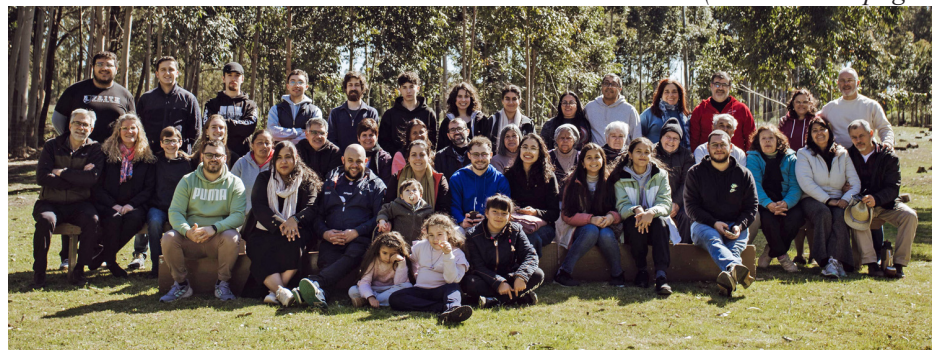
August Winter Retreat for Gethsemani Church