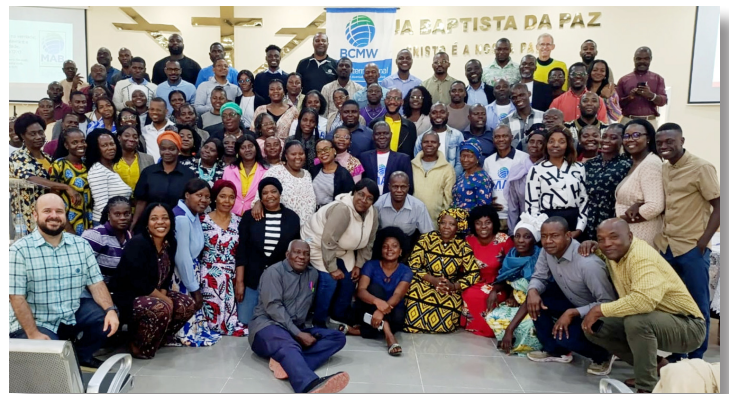
Peace Baptist Church BCMWW Conference in Angola

¡Dios te bendiga! (God bless you, in Spanish)†