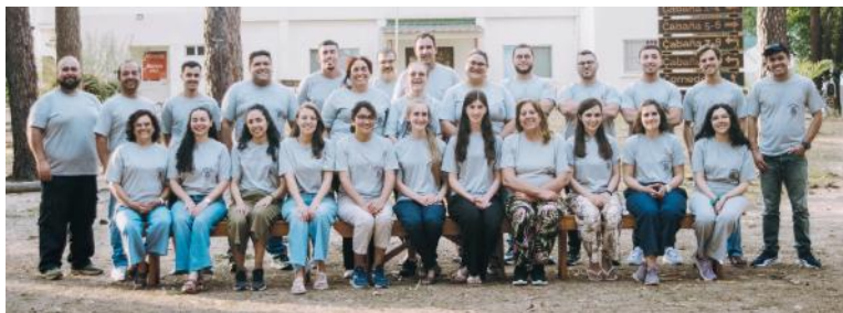
Many of the workers who are serving at camp this Summer

Using the unique benefits of a Christian Camp, Campamento Emanuel serves people by presenting God's Truth with God's love so that lives can be transformed for God's glory.