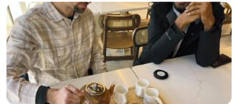
Practicing relational evangelism over tea

will finally be willing to receive God's Word. And we want to find those who would be willing to study the Bible.