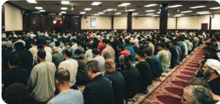
Roughly one-quarter of the world's people practice Islam

I began writing a weekly prayer email for those who would join in praying regularly for X. I praise the Lord for a large army of prayer warriors who continue interceding as I keep writing, even until now.