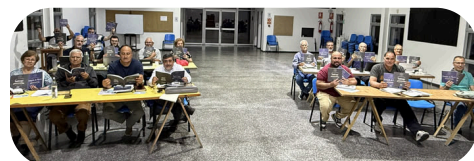
Uruguayan Pastors holding up their Study on the Book of James